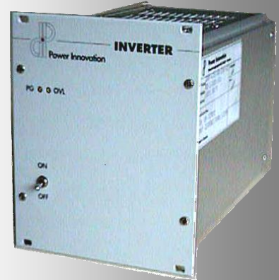
Picture may differ from actual device